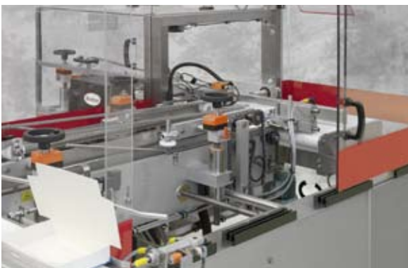
Easy size change